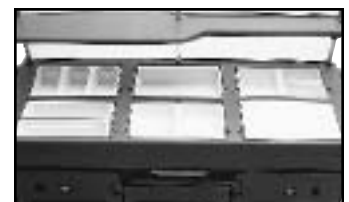
6 Well Top