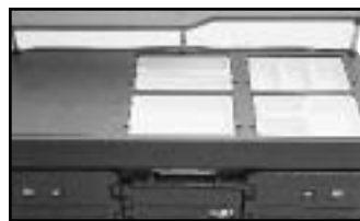
4 Well Top